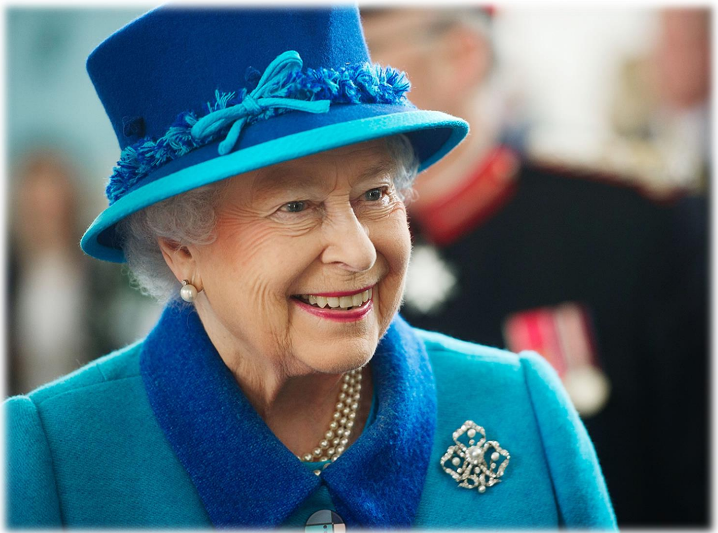
Queen Elizabeth II, 1926 – 2022