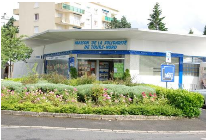
The community centre where we have begun to volunteer