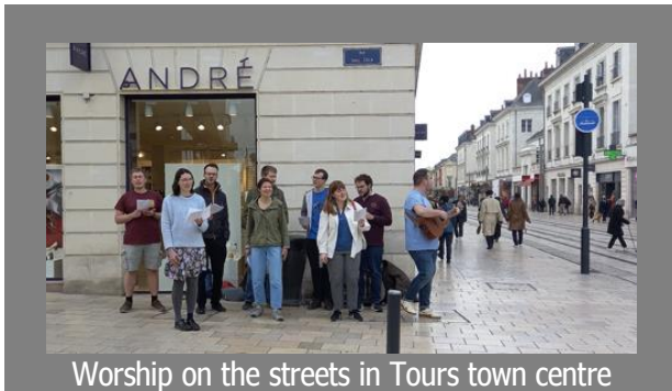
Worship on the streets in Tours town centre