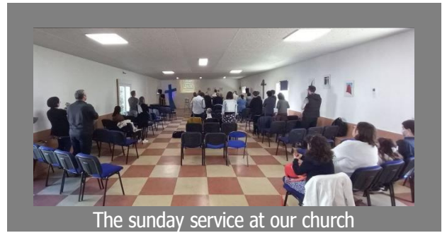
The Sunday service at our church

Please pray to and praise God for these things: