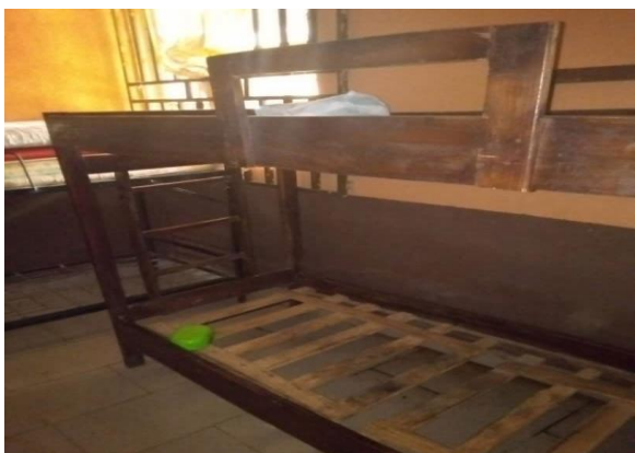
Fig D. School Hostels showing the Bunk Beds