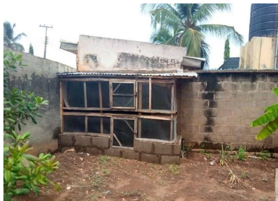
Fig F. Poultry Pen towards Independent Skills Training