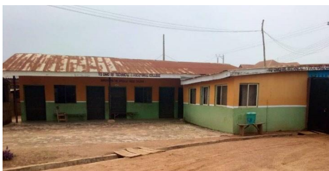
Fig C. Current Classrooms