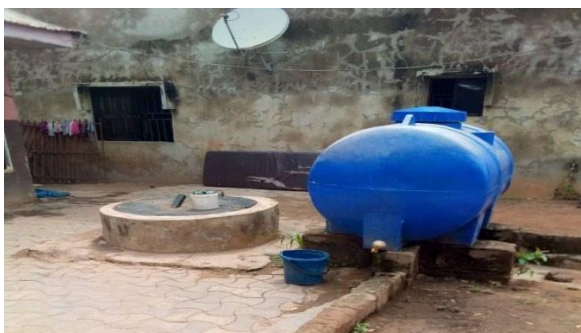
Fig B. School's Well

Towards this appeal, OAKonsult will ensure that there is robust monitoring and evaluation of the funds given and will endeavour to provide reports on how funding has been used for this project.