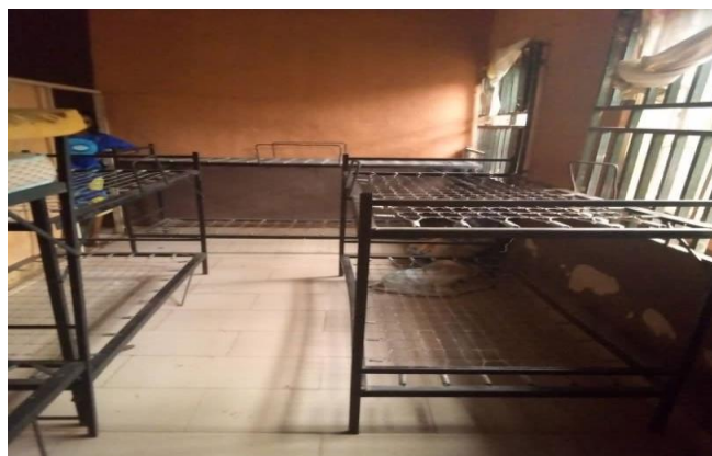
Fig E. School Hostels showing more Bunk Beds