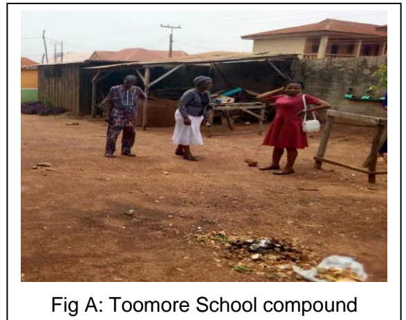
Fig A: Toomore School compound

Persons with disabilities in Nigeria persistently face stigma, discrimination, and barriers to accessing basic social services and economic opportunities. Today, they face even greater barriers brought about by the impacts of the COVID-19 pandemic. They usually experience negative attitudes at family and community levels, including name-calling, negative beliefs, and misconceptions surrounding the causes of disabilities (usually associated with religious or cultural norms, and beliefs). This leads to rejection, neglect, loss of respect, denial of identity or self-worth, and often to low self-esteem, depression, and isolation*. This, along with structural limitations and challenges, also reinforces barriers for persons with disabilities in accessing basic services such as education, health, public transport, and social safety nets. For example, Research shows "Only one in every ten children with disabilities gets access to education in Africa**.