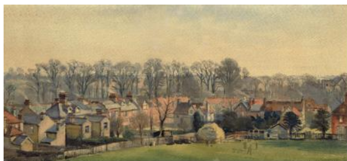
Orpington, White Hart Meadows, showing new houses in Moorfield Road on the left

Of course, refreshments will be available and there will be children's activities!