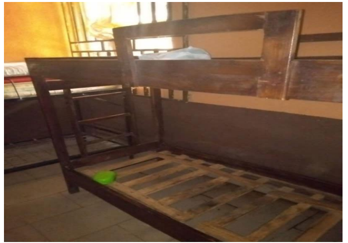
Fig D. School Hostels showing the Bunk Beds