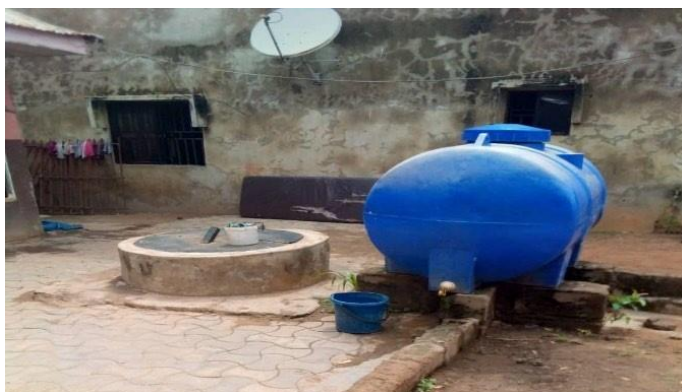
Fig B. School's Well

Towards this appeal, OAKonsult will ensure that there is robust monitoring and evaluation of the funds given and will endeavour to provide reports on how funding has been used for this project.