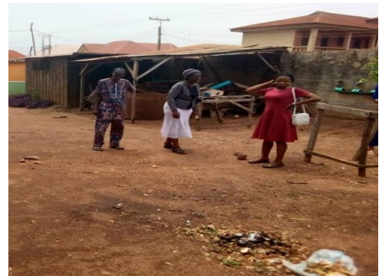
Fig A: Toomore School compound

Persons with disabilities in Nigeria persistently face stigma, discrimination, and barriers to accessing basic social services and economic opportunities. Today, they face even greater barriers brought about by the impacts of the COVID-19 pandemic. They usually experience negative attitudes at family and community levels, including name-calling, negative beliefs, and misconceptions surrounding the causes of disabilities (usually associated with religious or cultural norms, and beliefs). This leads to rejection, neglect, loss of respect, denial of identity or self-worth, and often to low self-esteem, depression, and isolation i . This, along with structural limitations and challenges, also reinforces barriers for persons with disabilities in accessing basic services such as education, health, public transport, and social safety nets. For example, Research shows "Only one in every ten children with disabilities gets access to education in Africa" ii .