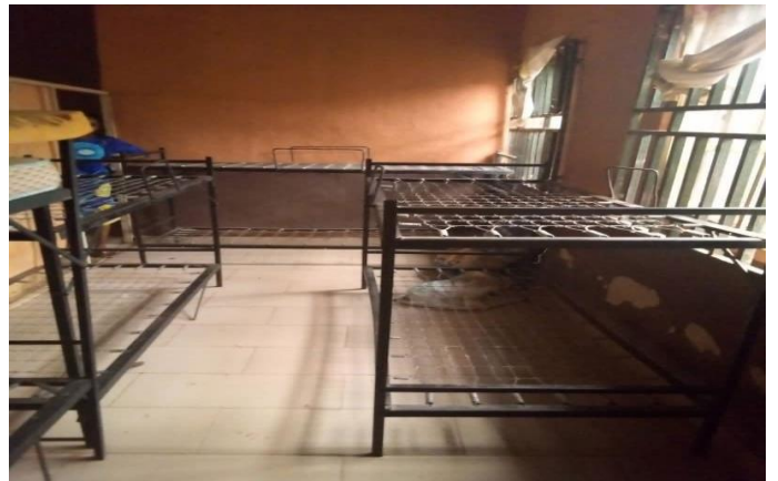
Fig E. School Hostels showing more Bunk Beds