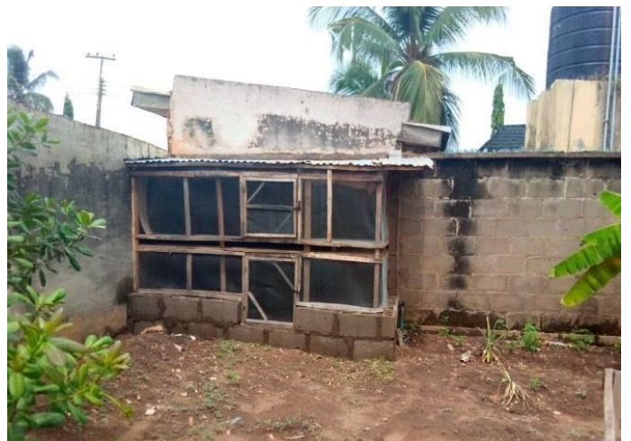
Fig F. Poultry Pen towards Independent Skills Training