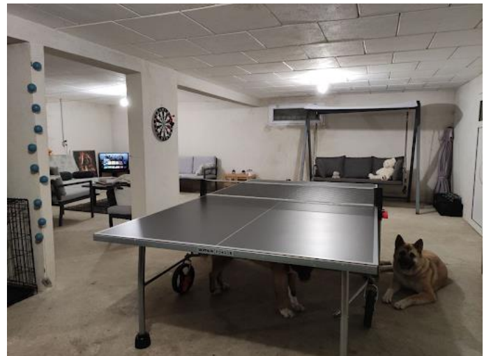
A potential venue for future youth socials - the basement of a family from church.

A few months ago, a lady from church, a friend of hers and I gathered to put melodies to some lyrics she had written (Christmas songs for church). Last weekend we had the joy of being able to record them together. This is especially lovely as there isn't nearly as much worship music written in French as in English, and particularly Christmas songs are nearly all translated. The idea is that the songs can be sung in churches. Once they're ready I'll send you all the recordings :-)