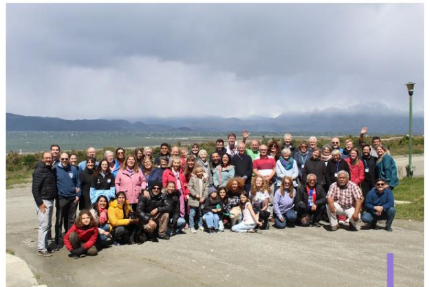
Everyone enjoying "Refresh"