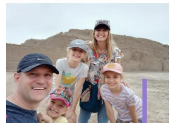
Photos from top to bottom: With the amazing women of Barrio Obrero; First day back at school; Sunday school in our car boot; Greetings from Lima.