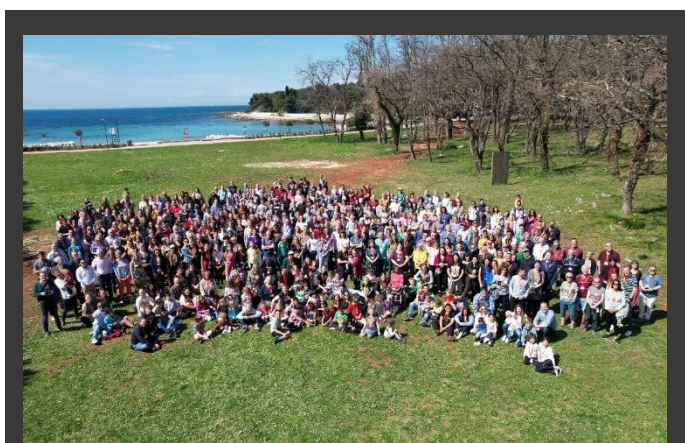
The ECM biennial conference group photo. A great encouragement to hear about God's work across Europe