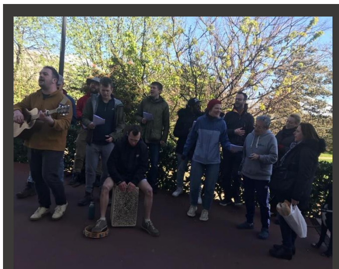
The team from King's one on of many times worshipping on the streets (in French as well as English). Two people started attending the local evangelical church after this one.