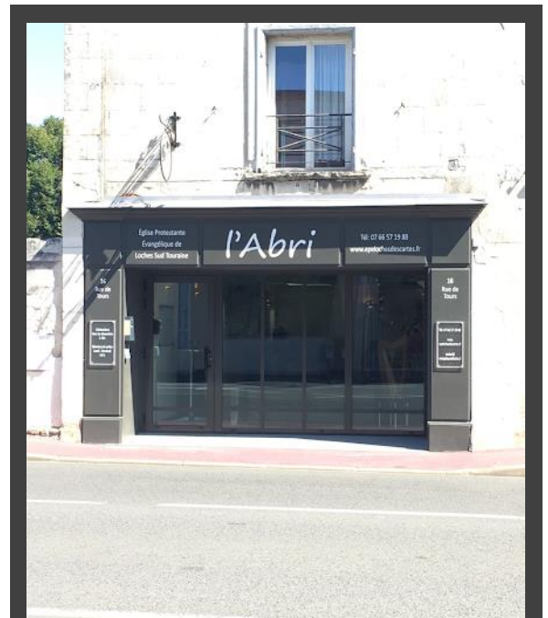
This is the church in Loches.