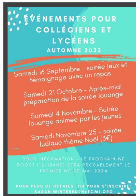
The flyer for the youth events this term

We had our first youth event of the academic year in September, with 8 youth from our church, who were hosted by a couple from church who live out in the countryside, who cooked for them and shared their testimonies. And, as per usual for this group we enjoyed board games together. I was very glad to be with other adults in this ministry. There is also another lady in church who has agreed to run the 11-14s on a Sunday morning around once per month, so we got together to plan the topics for the year, which I enjoyed. Coming up is the next worship evening run by youth groups from 4 different churches, with youth leaders in 'supporting' roles. Another thing I am thankful for is that one of the youth wants to do baptism preparation.