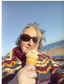
Ice cream at Mudeford beach the day I got the ordination news!

I'll start with the main news that I have been accepted to be ordained priest in the Diocese of Winchester at the end of June. I am very excited !!! It was a bit of a lengthy process but I think my case was a little unusual but God's timing is perfect.