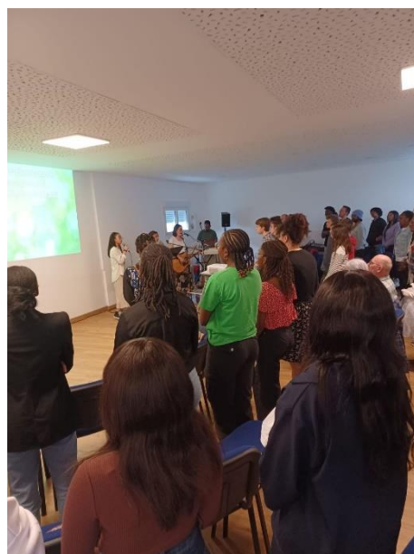
Youth worship evening held in the building of the Tours Nord church. There were people from at least 7 churches there.

I'm leading the music group again and running a workshop on 'there are so many faiths, why should I choose christianity?' (working title...) as well as being part of the oversight team.